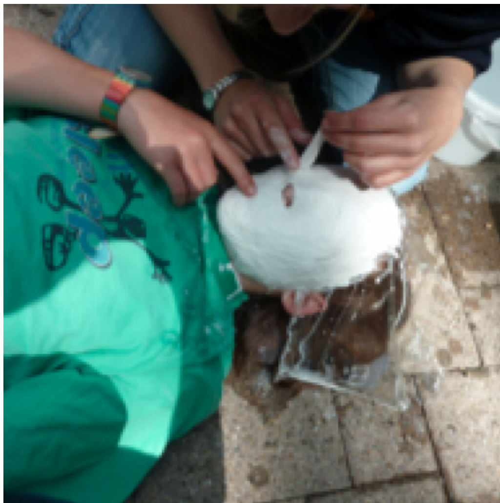
Plaster mask making: pictures 1 - 4