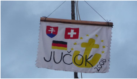
GLT_C1_Idea Exchange Creative Projects_1

In this ideas section we would like to give you some ideas and motivate you to develop your own creative ideas. For the planning and implementation of such projects, read the documents on project management and missionary local work